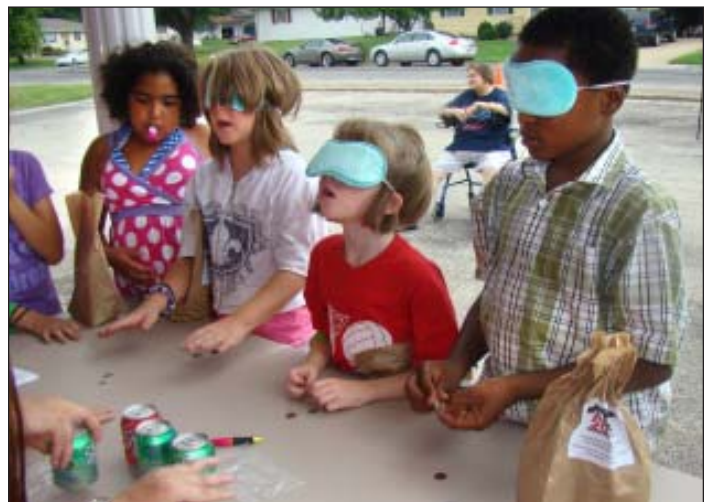
Several young people try to identify different coins by touch to purchase refreshments.