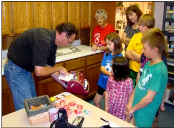
An ITAP representative demonstrates a few assistive devices at 2010 ADA Olympics.summer.

IATP has thousands of items to choose from. The items vary from computers, technology, kitchen, bedroom and bathroom aids, games, daily living items, mobility, vision, and hearing devices. There are a great many additional items in ITAP's inventory.